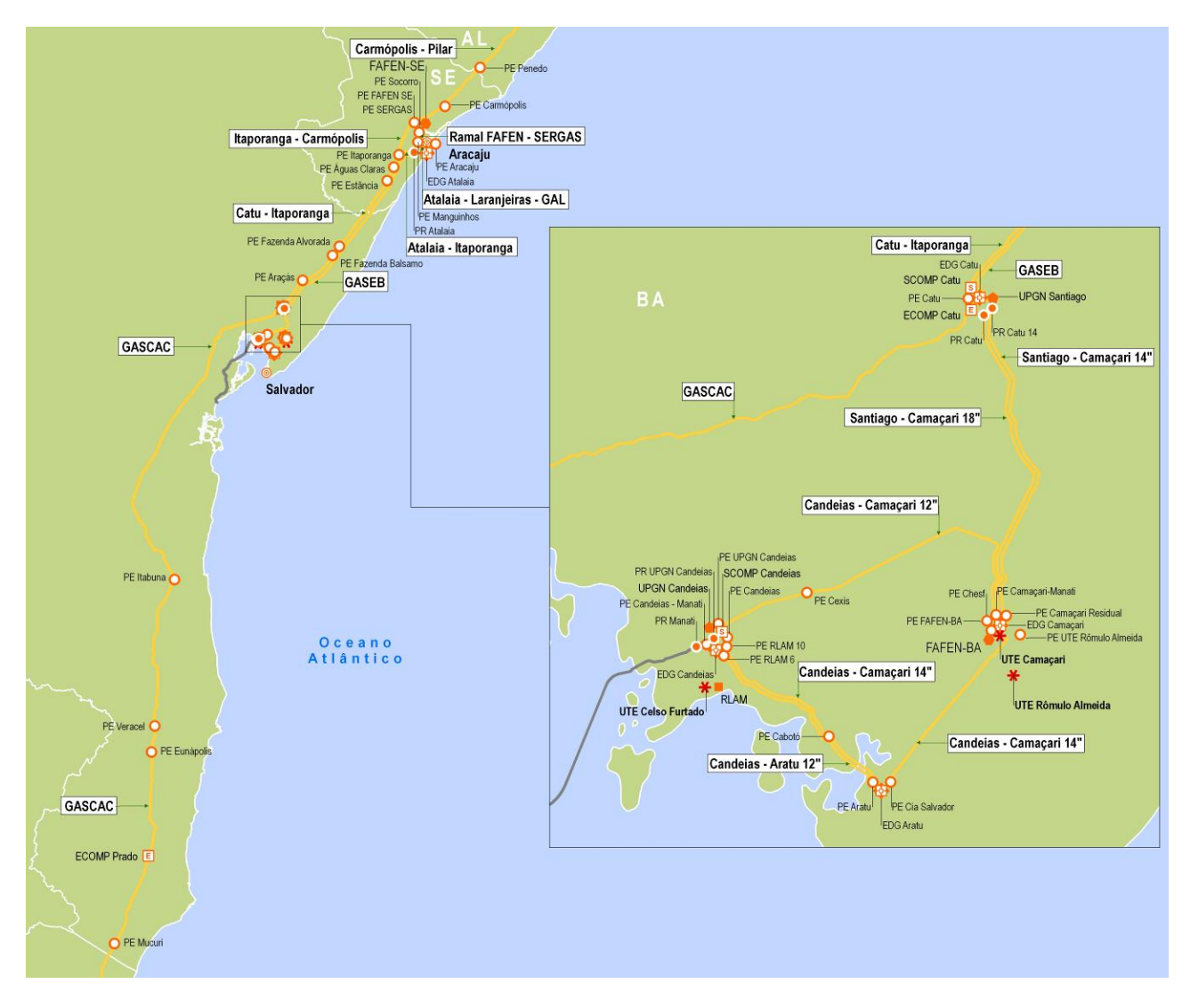
Figure 5. Second part of Northeast network

The second part of the Northeast network is the link to the Southeast network. It also has a complex system at Bahia state, where there are several supplies and deliveries with different pressure limit pipelines, linked right in the middle of the main network. This part of the network can be seen on Figure 5.