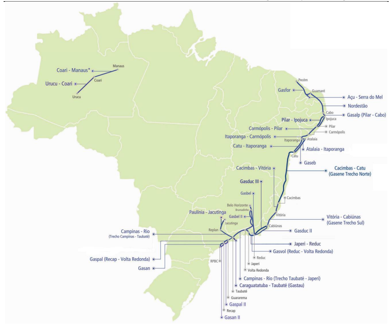
Figure 1. Gas Pipeline operated by Transpetro

Operating a network with this configuration isn't easy by any means. While most of the operation is controlled by Transpetro National Operational Control Center (CNCO), a lot of secondary actions must be taken in the field. Besides the day to day operation, the maintenance team work tirelessly to insure an operation as smooth as possible. With constant predictive and preventive action, such as pig passing in all the pipelines, constant operation and change of compressing station, etc. But any system is bound to have unpredictable problems. When a system of this size is consider, the chances of occurrence gets higher and higher, especially as the installations grow older.