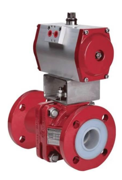
Figure 2. Example of a Shut Down Valve

For occasions such as this, the Rate Of Pressure Drop (ROPD or RPD) is a valid alternative. It calculates pressure drop during a time frame, closes if the pressure drop reaches its settings. The downsize is how to determine such setting. All normal operational scenarios must be considered (i.e. sudden star or stopping of a compressor, accidental closure of a supply or delivery, etc.). This setting is the most common to be activated without an actual emergency, usually due either to changes in the previous operation or a critical scenario not considered during the simulations to determine the setting. Figure 2 shows an example of a SDV valve.