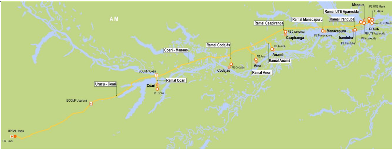
Figure 3. North network

The Northeast network can be divided in two separated segment, both geographic and complex wise. The first part is mostly consistent of several pipelines in line, with loops and branches along its course. With three compressing stations, three supplies e several deliveries, it has a more complex operation the North network, due to changes the gas flow has depending on the supply condition, specially due to the LNG re-gas plant. The first part of the network can be seen on Figure 4.