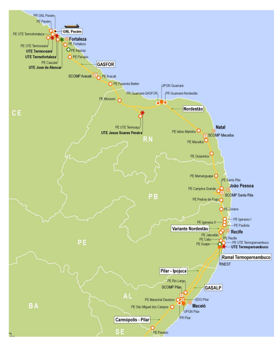
Figure 4. First part of Northeast network

The Northeast network can be divided in two separated segment, both geographic and complex wise. The first part is mostly consistent of several pipelines in line, with loops and branches along its course. With three compressing stations, three supplies e several deliveries, it has a more complex operation the North network, due to changes the gas flow has depending on the supply condition, specially due to the LNG re-gas plant. The first part of the network can be seen on Figure 4.